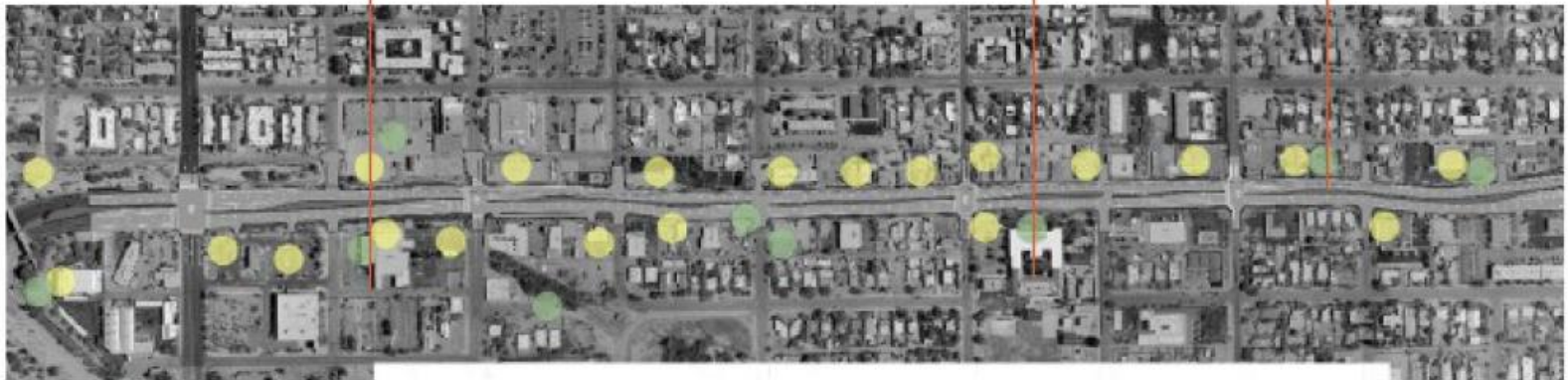
Broadway Boulevard "Power of ten" map