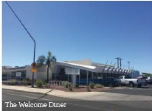
The Welcome Diner