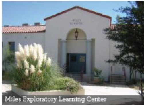
Miles Exploratory Learning Center