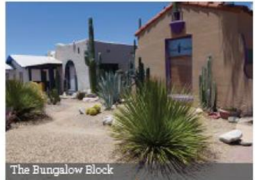
The Bungalow Block